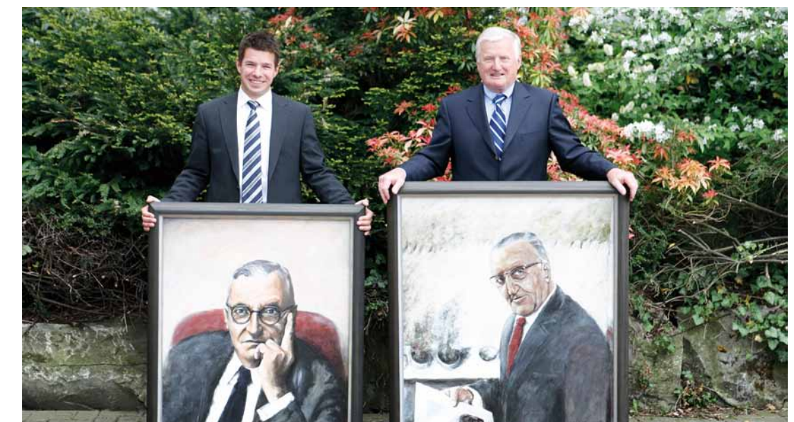
Four generations of the Kostal family

The close, trusting co-operation with our customers is especially important to us. Consequently, we take our time, work together to find individual solutions, and produce precisely the technical options needed for the specific requirements. Thus, in an intelligent way, we combine our extensive know-how and technical facilities with our proximity to the customer.