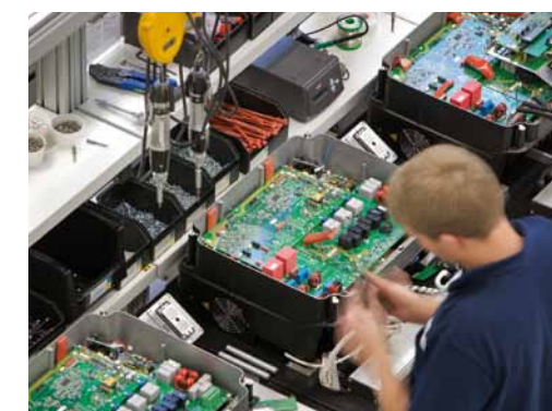
Final assembly of inverters

However, even after the start of production, we always keep a close eye on our products and are constantly working on possible improvements. As part of this, we make good use of the comments of our customers and we learn from outside experience.