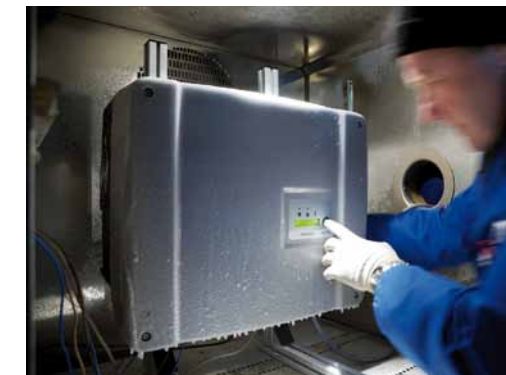
Inverter in the climate chamber

Even in the context of product development, possible sources of faults are analysed and eliminated. This is effected by the use of preventive quality tools, which have been developed by us specifically for this purpose.